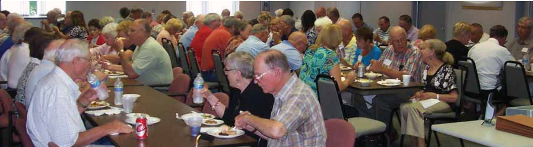
Retired MGU employees remain current on company news and catch up with former co-workers at MGU's annual retiree luncheons.

We're proud of what our retirees have helped MGU achieve through the years, and their efforts that still continue in the community (as in The Moving Wall Goes to Coldwater, page 10 ). ■